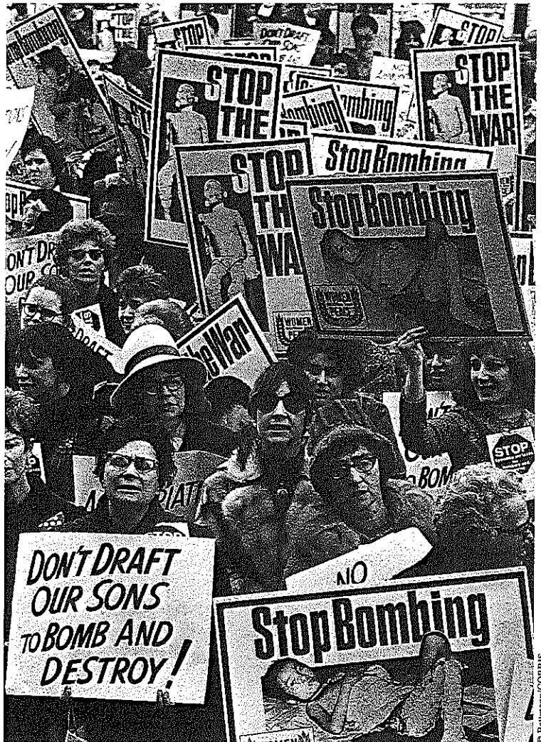
Photograph taken in the United States, 1967