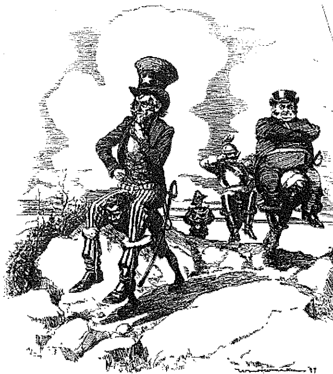
THE WHITE (?) MAN'S BURDEN.